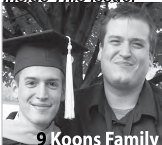
9 Koons Family